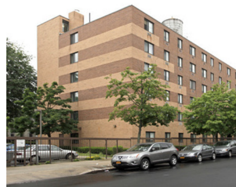
Gates Ave Senior Houses

By offering NORC services within the familiar setting of the senior home, this partnership strives to empower Older Adults to live fulfilling, active, and independent lives while remaining in their beloved homes. This venture represents a significant step in redefining Older Adult care, emphasizing the importance of community engagement and support in enabling Older Adults to age comfortably and gracefully within their preferred surroundings.